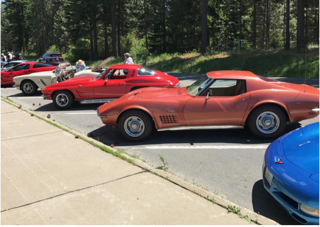
Pat's 1970 Coupe