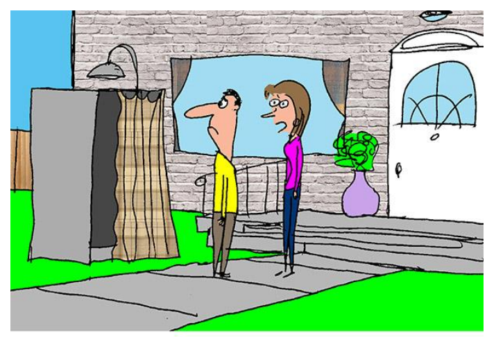
"If you want to ride in my new Corvette, you'll need to shower first. I set up an outdoor shower for your convenience."